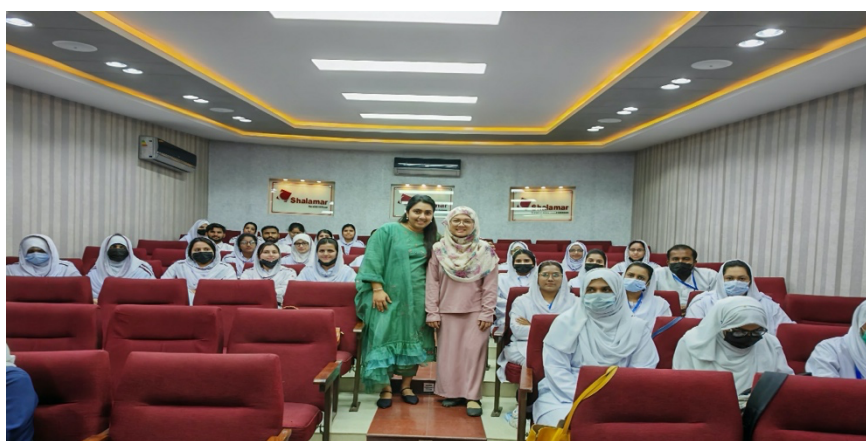
Teaching session for students, clinical instructors, and nurse educators

The training sessions were a success because the students were excited and showed eagerness to learn from trainers from MAHSA University. We received positive feedback from the participants and academic staff of SNC. Students have gained