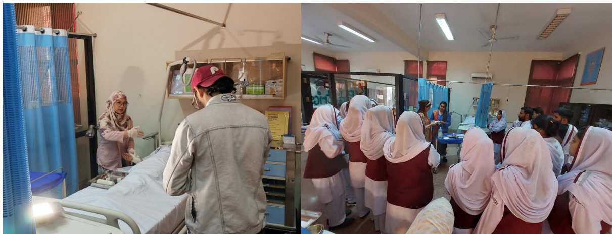
Recording of the skill demonstration at clinical skill lab

The training session have indirectly created a platform for us to market our post graduate programmes to the students, nurses, and academic staffs of SNC and Shalamar Hospital. They are very keen to further their postgraduate study with School of Nursing, MAHSA University. Students have also requested for student mobility programme from Shalamar Nursing College to MAHSA University.